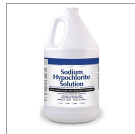
10% BLEACH SOLUTION (DILUTE ONE (1) PART OF 5.25% SODIUM HYPOCHLORITE WITH NINE (9) PARTS OF WATER