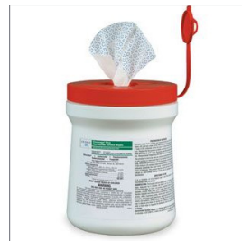
STERIS® 1608-G4 SURFACE WIPES – STERIS CORPORATION