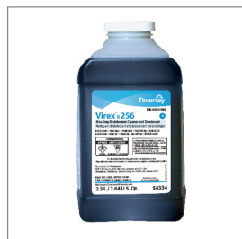
VIREX® II 256 JOHNSON PROFESSIONAL OXIVIR TB WIPES – DIVERSEY, INC.