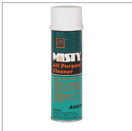
MISTY MULTI-PURPOSE DISINFECTANT CLEANER – AMREP INC.

This document provides a list of approved cleaning agents for the SR-130 X-ray System.