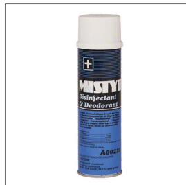
MISTY DISINFECTANT AND DEODORANT RTU – AMREP INC.