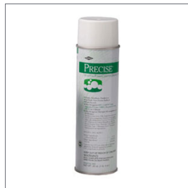
PRECISE HOSPITAL FOAM CLEANER DISINFECTANT – CALTECH INDUSTRIES, INC.