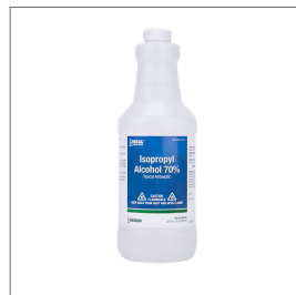
70% ISOPROPYL ALCOHOL