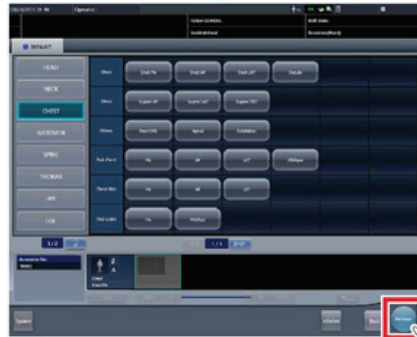
Select body part