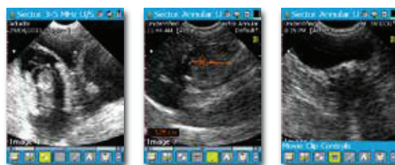
Pregnancy Check Mass Measurement Bladder