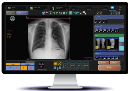
Imaging software supports detailed bone and soft tissue visualization.