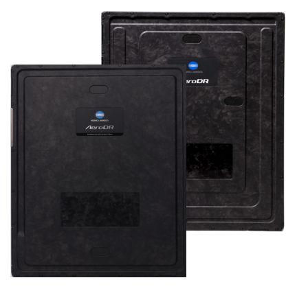
AeroDR Wireless Detectors

Konica Minolta Healthcare is a world-class provider and market leader in medical diagnostic imaging, healthcare information technology and white glove service innovations. While competitor's service offerings are focused on reactionary service support, Konica Minolta has created an array of value-rich service solutions that are focused on helping our customers maximize their investments every day and responding immediately – or even ahead of time – to critical issues.