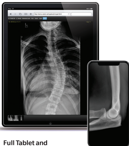
Full Tablet and Smartphone Access