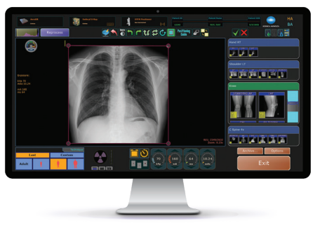
ULTRA Image Acquisition Software