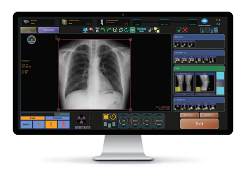
State-of-the-art imaging software supports detailed bone and soft tissue visualization.

Imaging flexibility, image resolution and immediate results in tabletop and standing exams allow you to make informed decisions faster when you use the Konica Minolta Floor Mounted Digital Radiography System.