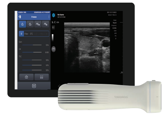
POCKETPRO H<sup>2</sup> Handheld Ultrasound System

The POCKETPRO H<sup>2</sup> 500L linear wireless handheld ultrasound system is designed for MSK, Vascular Access, and procedural guidance.