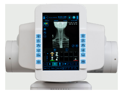
State-of-the-art imaging software supports detailed bone and soft tissue visualization.