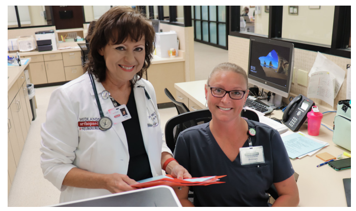
Staff members at Midlands Orthopaedics & Neurosurgery.

Plus, while many orthopedists can do a good job delivering injections without ultrasound guidance, they can do an even better job using ultrasound, as it helps guide the injectate placement precisely where it needs to go.