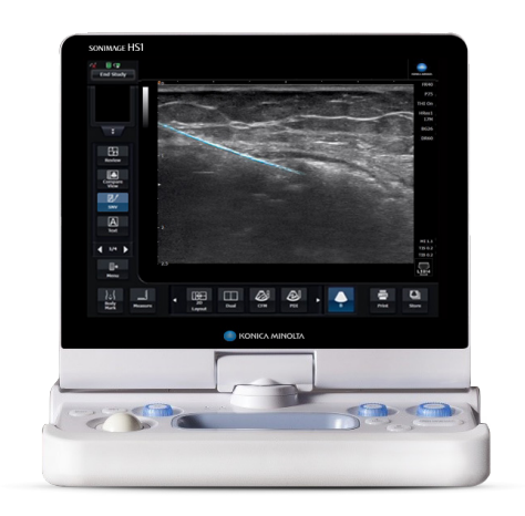
Konica Minolta SONIMAGE HS1, SNV image on screen

The use of ultrasound for diagnosis and intervention in sports medicine, pain management and regenerative medicine is becoming a standard of quality care supported by clinical evidence and recommended by several medical associations. Ultrasound increases the accuracy of targeted injections that may lead to better patient outcomes. It is a cost-effective imaging technology ideal for use at the point of care.