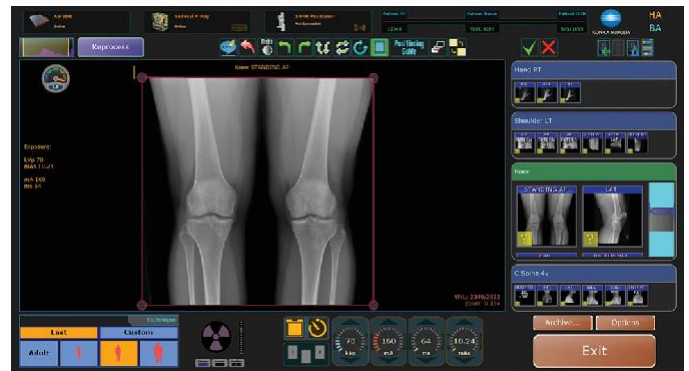
Ultra Acquire Software

DICOM compliant connectivity to RIS/PACS, Procedure Code Mapping Tool, Study Append, Free Text Annotation, Automatic Masking, Study List Filter, History, Image Zoom, Grid Suppression, HIPAA compliance enabling features (password protection, screen black out), Foldering (Study Combine and Move), DICOM Store, DICOM Modality Worklist